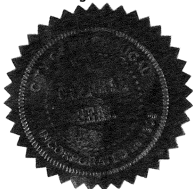
Rochelle Ramos, Mayor

and encourage all citizens to join in appreciation of our public employees.